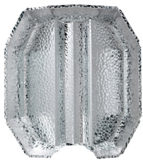
Wide Spread Reflector